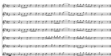
Versions of the beginning of the song Toen ik op Neerlands bergjes stond