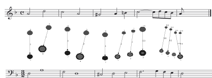
Example weight flow between melodies