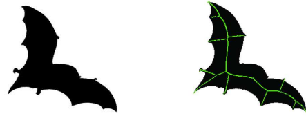
Figure 2: Left: a view of a bat. Right: the shock graph constructed from the medial axis and superimposed on the left image.

After detecting changed laplacian eigenvalues when spectral integral variation occurs, we perform the following process for each given database graph offline. Suppose that the minimum number of edges in a subgraph for which we compute the signature is k . Given a database graph G = (V, E) , we first create its subgraph \hat{G} with |V| vertices and k edges and compute its laplacian eigenvalues. Since the second smallest laplacian eigenvalue is positive if and only if the graph is connected and the multiplicity of zero as a laplacian eigenvalue reflects the number of connected