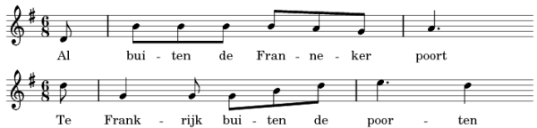
Figure 2. Example of true positive for the query song “In Frankrijk buiten de poorten” (2 nd version) OGL19406 with its NN, OGL41709.