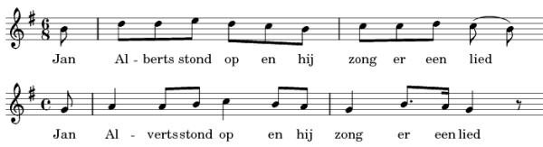
Figure 1. Example of false positive for the query song “Heer Halewijn” (3 rd version) OGL19205 with its NN, OGL19107, instance of “Heer Halewijn” (4 th version).

on weight transportation such that the surplus of weight between two point sets is taken into account.