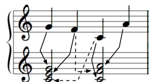
Figure 2. Matching the pitch distribution from the accent notes of 3 melodies (lower staff) with a single melody (upper staff). Purely by chance the query melodies form major chords. All \tilde{w}_i are 1 and the \hat{w}_j are proportional to the duration of the notes (OR-query). Different \alpha and \beta can result in different matches for upper notes F and C.

Figure 2 and table 1 illustrate the effects of \alpha and \beta for the OR-queries in a very simple case. Time is given in quarter notes and pitches in semitones. Each quarter note's weight is 1 and all note duration must flow from the upper melody to the chords, with both chords to be completely matched with duration 2.